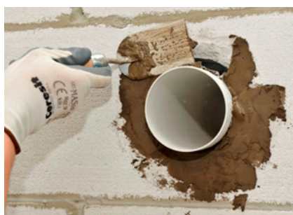
Assembly with Ceresit CX5 Express mortar (substrate prewetted)