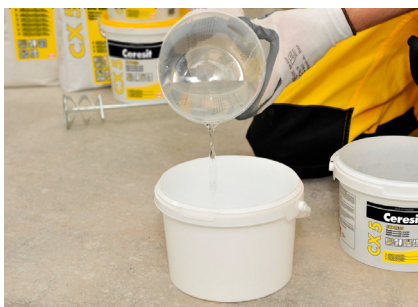
Measure the amount of water needed