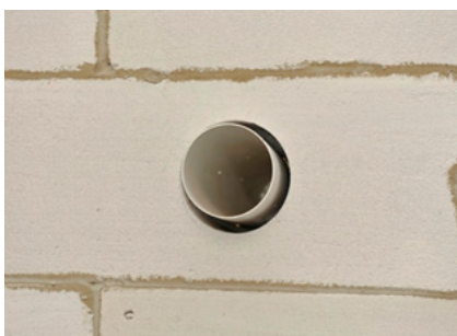
Set the fastened element in the correct position