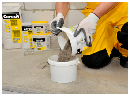
Pour the material into the water